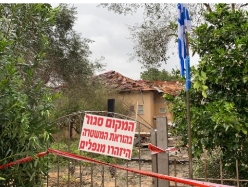
Damaged home in Mishmeret.