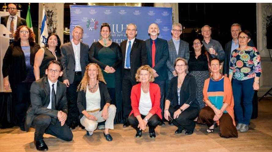
Some of the 500 participants in Entrepreneurship Day.

The event promoted future collaborations between the hosting organizations, and was attended by about 500 people from a variety of disciplines and professions. The intention is for Entrepreneurship Day to become an annual event.