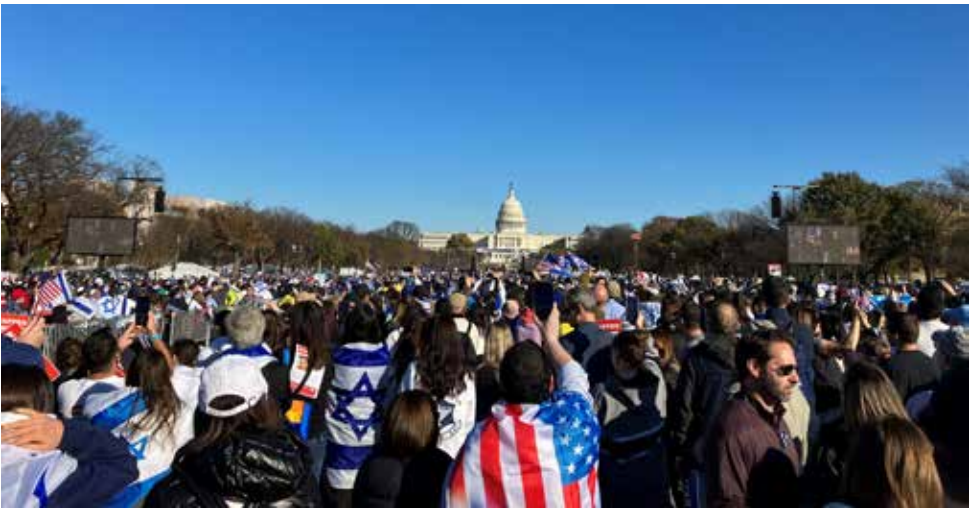
Looking toward the U.S. Capitol on the National Mall during the March for Israel, November 14, 2023

After the meetings, we headed to the March at the National Mall. The streets were closed to traffic. Security forces surrounded the Mall, including