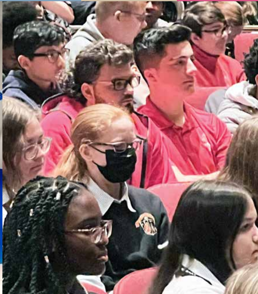
Father Desbois community lecture and Diversity Day student program