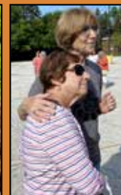
Young Adult Programs