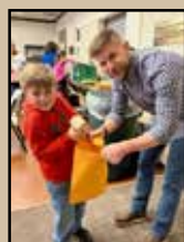
Jewish Senior, Family and Social Services

University of Toledo & Bowling Green State University