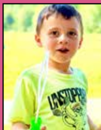
Gan Yeladim Preschool