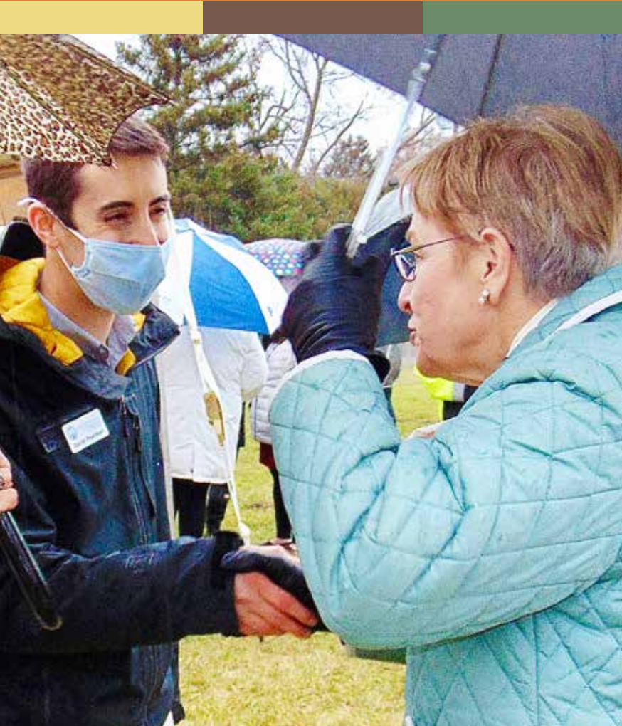
Shine a Light community rally

JCRC represents the Greater Toledo Jewish community, Israel, and Jews to the general community; other ethnic, racial, civic, and religious groups; government; and the media by educating and advocating on important issues.