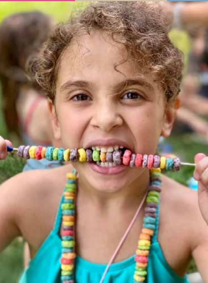
Camp Inspiration Fund

Think about the future. An endowment is forever.