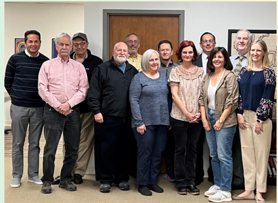
Federation Board members present at March, 2023 meeting.