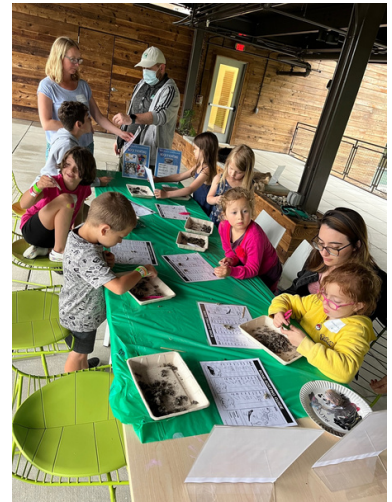
Youth activities were offered at the Annual Meeting held at Berks Nature in June.