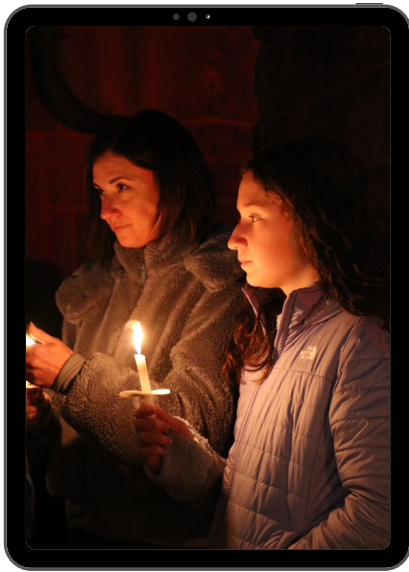
Kristallnacht service and candlelight vigil

The Jewish Community Relations Council continues to fight for social justice and combat antisemitism in Berks County and beyond.