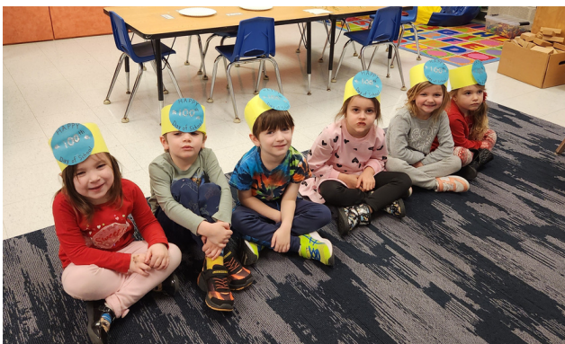
Celebrating 100 days of preschool.