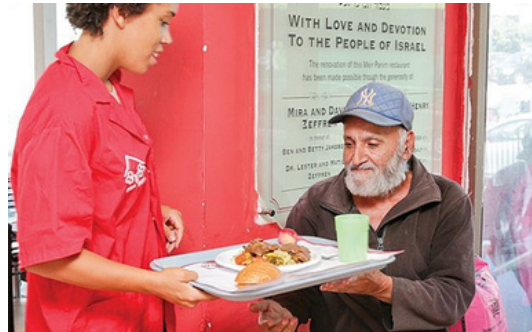
A client being served at one of several Meir Panim locations.

Meir Panim - based in Israel, their mission is to alleviate and diminish the harmful effects of poverty on thousands of families across Israel by supporting a range of food and social service programs aimed at helping the needy with dignity and respect, including free restaurants, meals-on-wheels, school lunch programs, prepaid food card distribution, vocational training and after-school youth clubs. For more information on this organization, please visit www.meir-panim.org