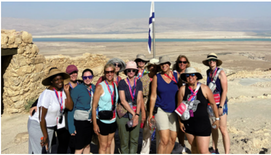
Momentum moms atop Masada, overlooking the Dead Sea

The subsidized trip is 9 days long, followed by a year-long journey here at home, learning more about bringing Judaism into our lives and our homes.