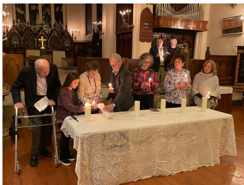
Honoring our Holocaust survivors during the Kristallnacht service.