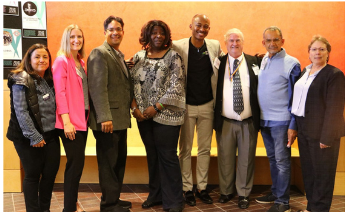
Members of the Greater Reading Unity Coalition