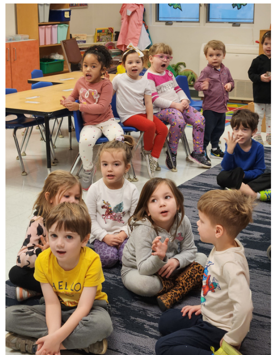
Lakin preschoolers celebrating Dr. Seuss' birthday.