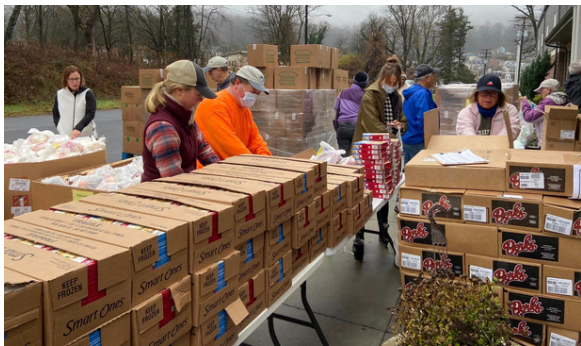
Food Pantry volunteers are hard at work twice monthly, rain or shine to help those in need.