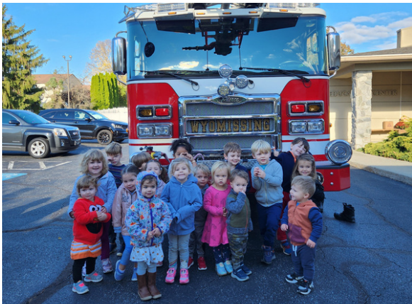
LPS kids enjoying a visit from the Wyomissing Fire Department.