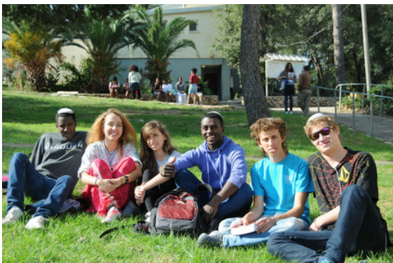
Yemin Orde students come from around the world.