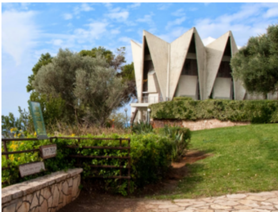
Synagogue of Yemin Orde on Mt. Carmel.

Yemin Orde - a Youth Village in Israel that is a home, school and safe-haven to 450 children from around the world. The Village has welcomed children from France, North Africa, Iran, India, Yemen, Eastern Europe and South America. Most of the children have suffered trauma in their young lives from isolation and neglect, to abandonment and extreme poverty. At Yemin Orde, they find a home, a family and a future. For more information about this organization, please visit www.impact-israel.org