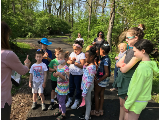
PJ Library participants gather for a book walk at the Exeter Library.

Offering a variety of programming is one element that strengthens both our Jewish identities and our community connections. We do our best to provide something for all ages, from toddlers to adults. We also collaborate with other organizations to maximize our offerings.