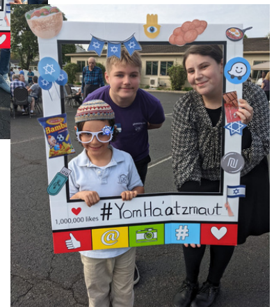
Yom Ha'atzmaut is fun for kids and adults of all ages!