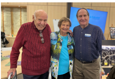
Annual Meeting 2022