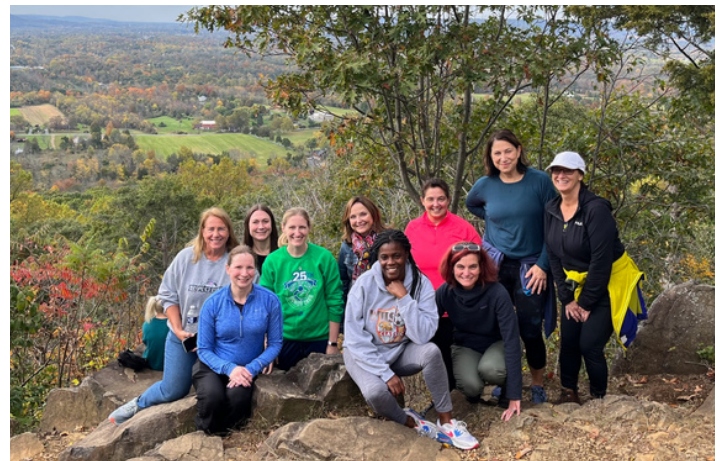
As part of the continued learning curve, the group met to hike Monocacy Hill.