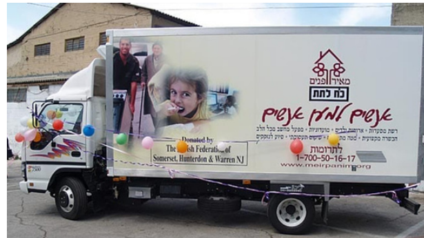
This refrigerated truck was donated to Meir Panim by a Jewish Federation in New Jersey.