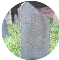
The desecration of Jewish gravestones which has just occurred in America also happened with frequency in Nazi Germany. (LEFT – Desecration of a Jewish Cemetery in Philadelphia, February 27, 2017.) (RIGHT – Desecration of the Playwright's great grandparents' gravestone by Nazis, Seiburg, Germany, 1938.)

Ingrid and George Rose have successfully rebuilt their lives in Britain after fleeing Nazi Germany but, when their 15-year-old son Paul is a victim of bullying and anti-Semitism at school, the trauma of their own persecution reemerges with almost deadly consequences. "The Roses in June," set in swinging London on the eve of Israel's 1967 Six-Day War, explores the struggle of love, fear, regret and forgiveness on the eve of a possible second Holocaust and against the burdens of prejudice, traumatic memory and the complex attitude of the English towards the Jews as the school attempts, at all costs, to avoid any scandal.