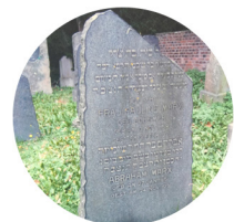
The desecration of Jewish gravestones which has just occurred in America also happened with frequency in Nazi Germany. (LEFT - Desecration of a Jewish Cemetery in Philadelphia, February 27, 2017.) (RIGHT - Desecration of the Playwright's great grandparents' gravestone by Nazis, Seigburg, Germany, 1938.)

Ingrid and George Rose have successfully rebuilt their lives in Britain after fleeing Nazi Germany but, when their 15-year-old son Paul is a victim of bullying and anti-Semitism at school, the trauma of their own persecution reemerges with almost deadly consequences. "The Roses in June," set in swinging London on the eve of Israel's 1967 Six-Day War, explores the struggle of love, fear, regret and forgiveness on the eve of a possible second Holocaust and against the burdens of prejudice, traumatic memory and the complex attitude of the English towards the Jews as the school attempts, at all costs, to avoid any scandal.