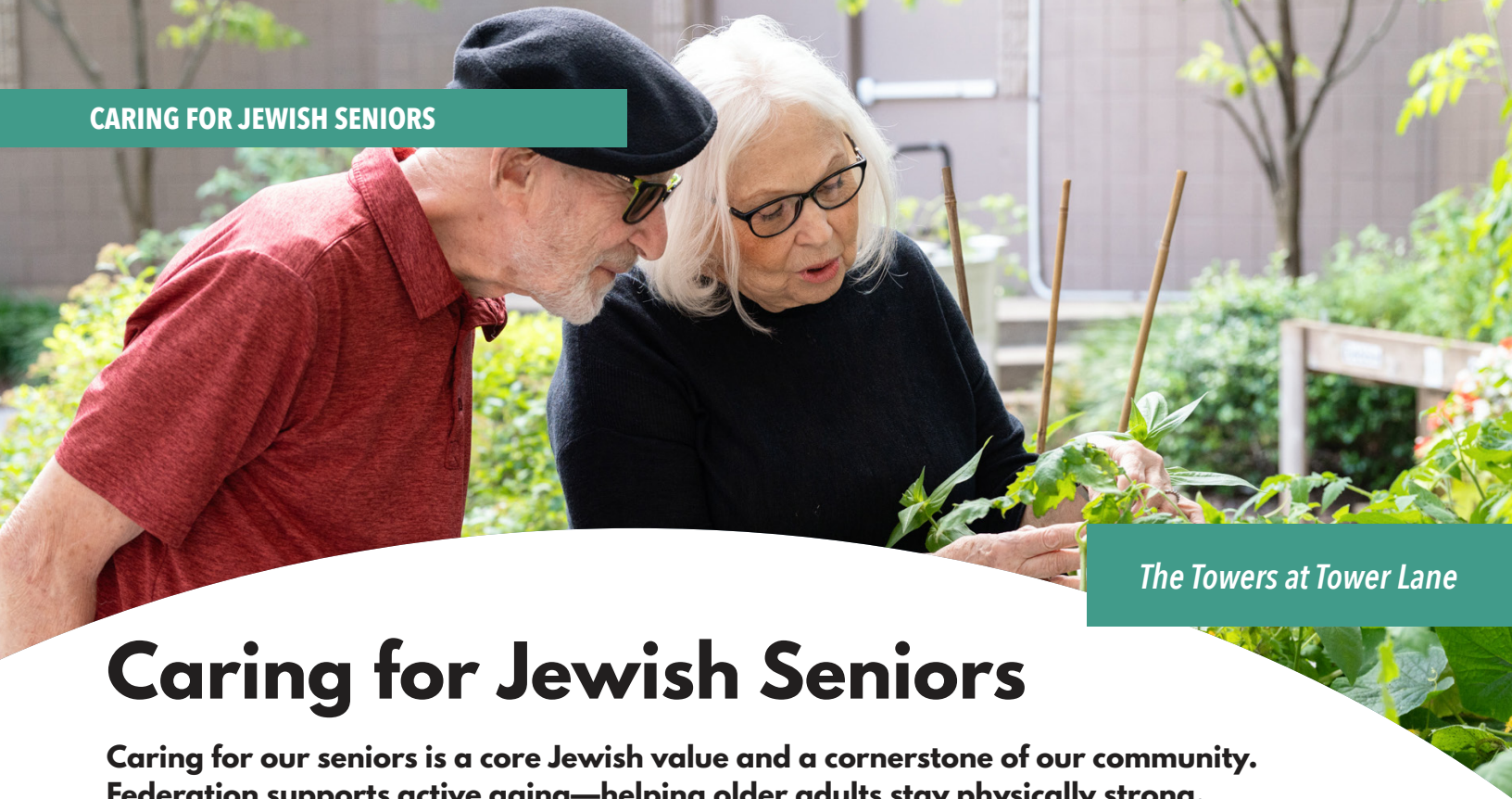
The Towers at Tower Lane