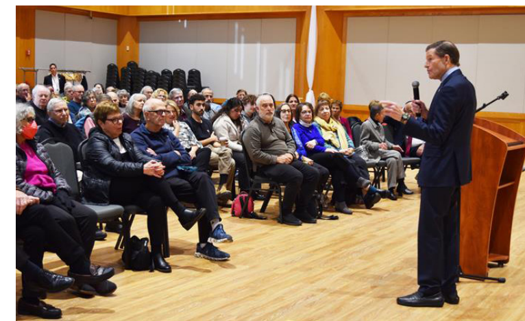
US Senator Richard Blumenthal addresses our community at the JCC.

We are building relationships with our elected leaders at every level, to share our experiences, be a resource for them when issues of community importance arise and ensure our voices are heard in the halls of power. This year, we held multiple meetings with our Federal, State and Local elected officials and led several zoom meetings with them as well.