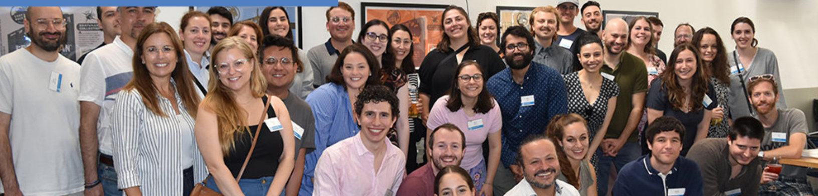
More than 40 young professionals gathered for the Young Leadership Kick-off Event

The Jewish Federation of Greater New Haven is committed to building a strong and vibrant future by investing in the next generation of Jewish leaders.