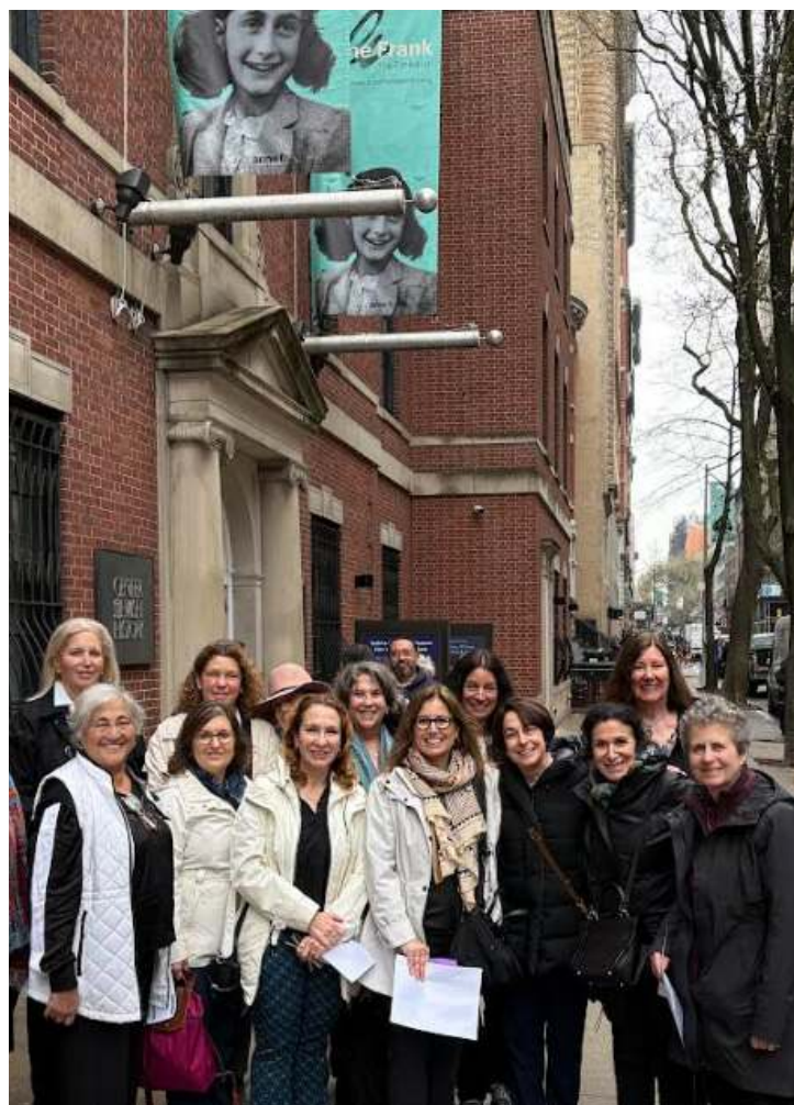
Photo at Right: A Women's Day Trip to NYC to Visit the Anne Frank Museum Exhibit

More than fundraising, this work transforms lives through connection, education, and acts of loving-kindness (g'milut chasadim), mitzvot, and tzedakah . Women's Philanthropy raises nearly half of the Annual Campaign each year—fueling programs that feed the hungry, educate children, support seniors, and strengthen Jewish life locally and around the world. It is a movement of women building community and inspiring one another to act.