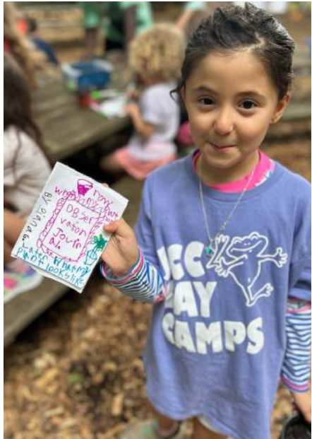
JCC Day Camps