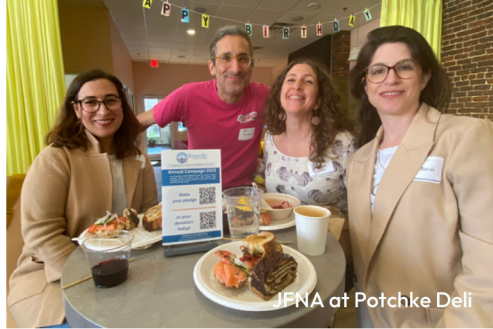
JFNA at Potchke Deli