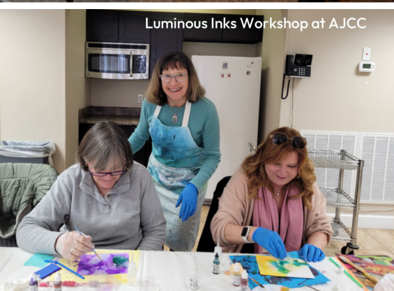
Luminous Inks Workshop at AJCC