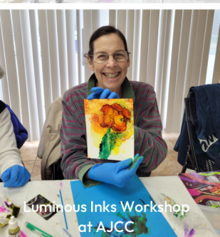
Luminous Inks Workshop at AJCC