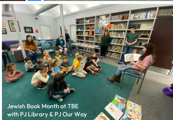
Jewish Book Month at TBE with PJ Library & PJ Our Way