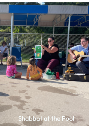
Shabbat at the Pool