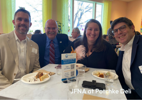
JFNA at Potchke Deli