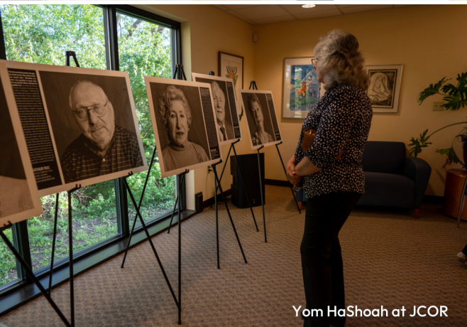
Yom HaShoah at JCOR