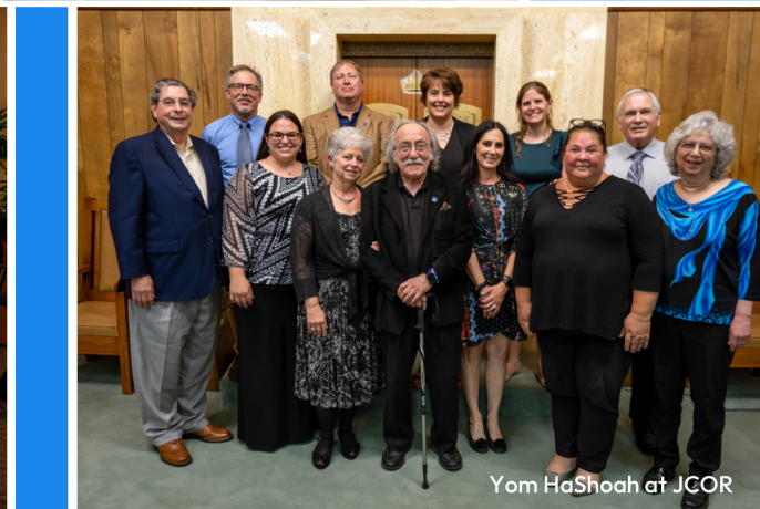
Yom HaShoah at JCOR