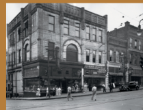
200 block of Gay Street, east side, looking south. Diftler's Credit Jewelers, The Club, Red Top Beer, Dixie Loan Co., and United Loan Co. Photo taken 1937.