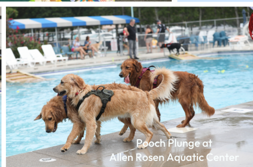
Pooch Plunge at Allen Rosen Aquatic Center