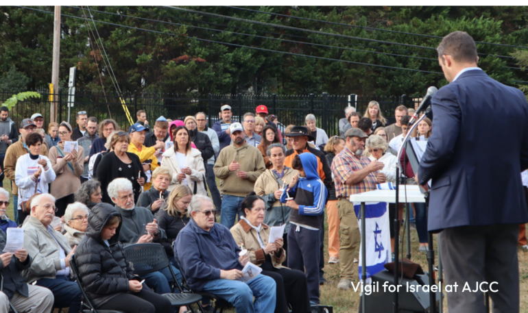
Vigil for Israel at AJCC

This year, KJA programming engaged all ages through a spectrum of events. We created Jewish community spaces, as well as Knoxville community spaces.