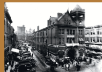
Market Square looking North from Union Avenue, showing Market House, with parts of Market Square West and East, 1928.