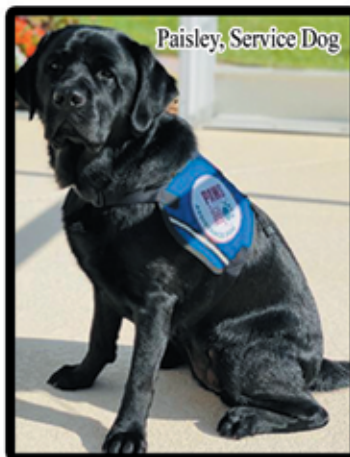
Paisley, Service Dog