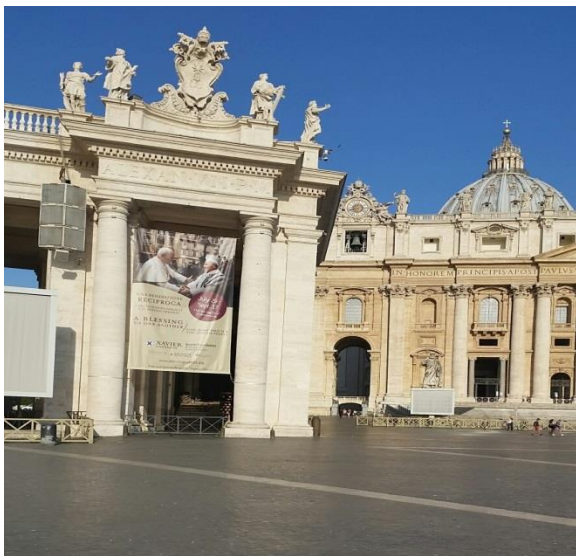
The banner announcing the exhibit on St. Peter's Square.

Come learn how the relationship between Catholics and Jews has been transformed since the Second Vatican Council (1962-1965). In particular, discover an exhibit— A Blessing to One Another —that highlights the steps taken by St. Pope John Paul II to dramatically improve Catholic-Jewish relations. The exhibit was on display last year in exhibition space of the Vatican Museums on St. Peter's Square.