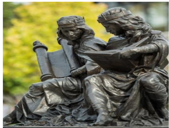
Synagogue and Church in a new relationship