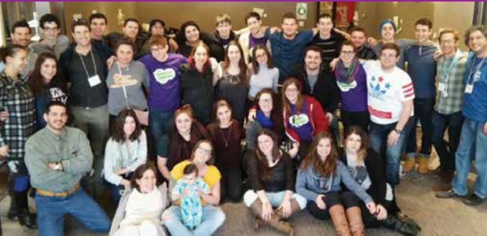
Hillel students from Calgary, Winnipeg and Edmonton enjoyed a full weekend of activities and making great connections at the annual Shabbat Shabang, hosted in Calgary January 22-24.