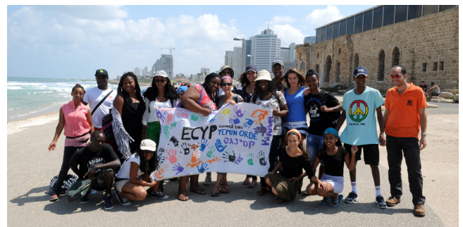
ECYP fellows and Israel teens in Tel Aviv