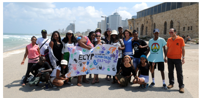
ECYP fellows and Israel teens in Tel Aviv