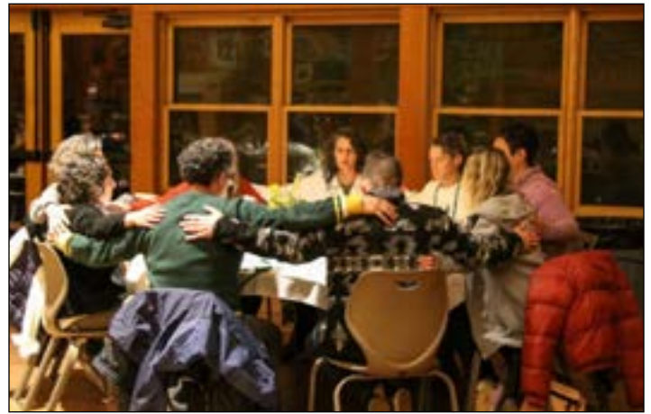
Above left: Participants in a Divorce and Discovery retreat celebrate Shabbat services at Camp Tawonga in California. Above right: Small group discussion and community building, in groups of six to eight participants based on age range, is a foundational aspect of Divorce and Discovery.