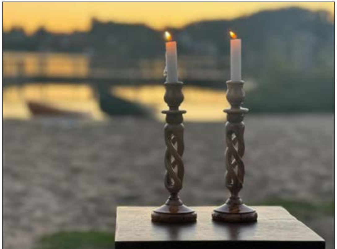
Shabbat candles burn on the beach at a Divorce and Discovery retreat at Camp Tawonga in California. Jewish ritual observances, many of them adapted to address the spiritual needs of those who have experienced divorce or partner separation, are a key element of the retreat.

“Coming from someone who experienced a huge financial change once I got divorced,” she said, “I know how stressful and overwhelming it might feel for people to say, ‘I don’t even know if I can do this right now because I can’t afford it.’”