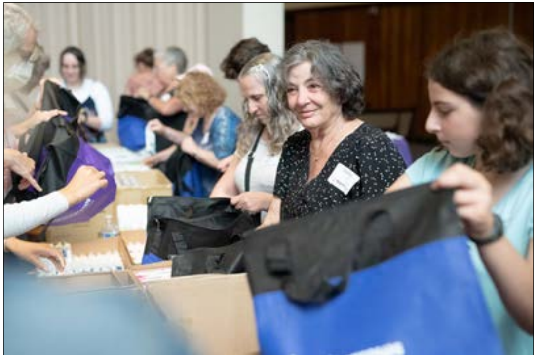
Volunteers load Dignity Grows' signature tote bags with hygiene supplies during a packing party at Congregation Neveh Shalom in Portland Sunday, Sept. 27, 2023. Dignity Grows will host a packing party at the Mittleman Jewish Community Center Sunday, Sept. 22.

Dignity Grows provides menstrual products and other hygiene supplies to health agency partners around the community in discrete, individual totes – supplies are donated and packed into totes by volunteers at packing parties like the one on Sept. 22, then picked up by partners and given to those in the community who need them most. Dignity Grows packed more than 2,000