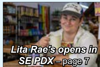
Lita Rae's opens in SE PDX – page 7