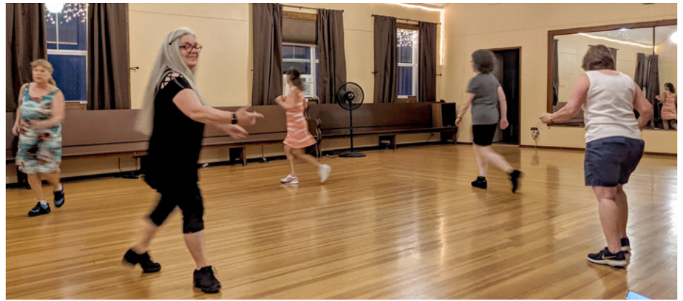
Israeli Folk Dancing returned to Leedy Grange July 26. Dancers relished the return of dancing indoors on wood floors. The Monday classes continue to be streamed on Zoom, so dancers from around the world can be part of the dance community. Organizers are monitoring COVID-19 and may shift back to Zoom or add mask requirements.