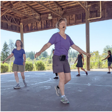
Dancers have enjoyed in-person dancing outdoors at the Multnomah Arts Center since October.