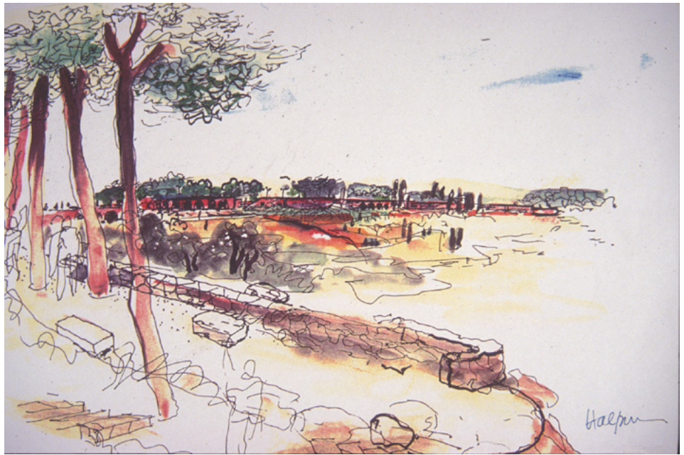
Drawing by Lawrence Halprin, z"l. View from Goldman Promenade looking toward the Haas Promenade. The Haas Promenade overlooking Jerusalem is likely one of Halprin's most visited designs in Israel, with most tour groups stopping there for the magnificent view of the Old City, the Dome of the Rock, Mount Scopus, the modern sections of Jerusalem and the desert beyond. (Courtesy Bruce Levin).