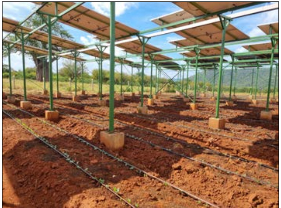
A Kasser Joint Institute Agrivoltaics research site in Kenya.

Agrivoltaics places solar panels over crops, Allon said, to reduce the temperature and infrared radiation levels around the plants – this leads to less water usage. The type of solar panels used in these arrangements, she explained, are some of the lowest cost panels on the market, making this type of water