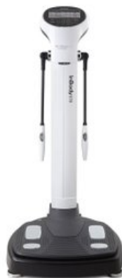
InBody 570 Body Composition Analyzer