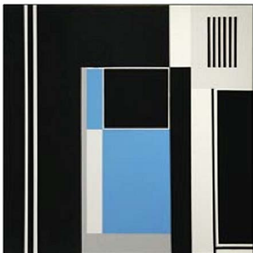
Flat Ice by Chad Avery