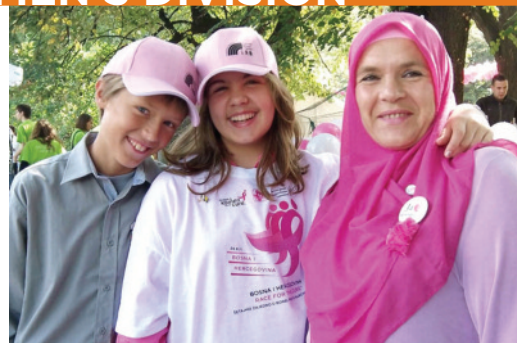
JDC supports Race for a Cure in Sarajevo

Our Women's Division (WD) at the Jewish Federation of Greater Santa Barbara works year-round to provide support to those in need locally, whether they be housebound seniors, young families or anyone in between. But the Women's Division also looks beyond the Central Coast, and is reaching out literally halfway around the world to provide life-saving mammograms and access to healthcare for women without means.