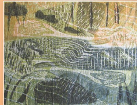
Sara Woodburn "East Fork Flux" 7 x 5.25 Woodcut