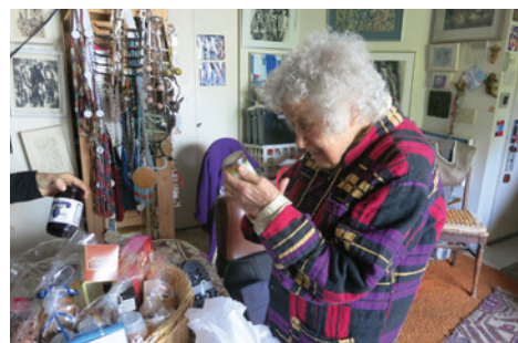
60 Days of Impact Top: YAD partnered with Habitat for Humanity to upgrade area homes. Above: The Jewish Women's Network delivered 25 Baskets of Love to local seniors.