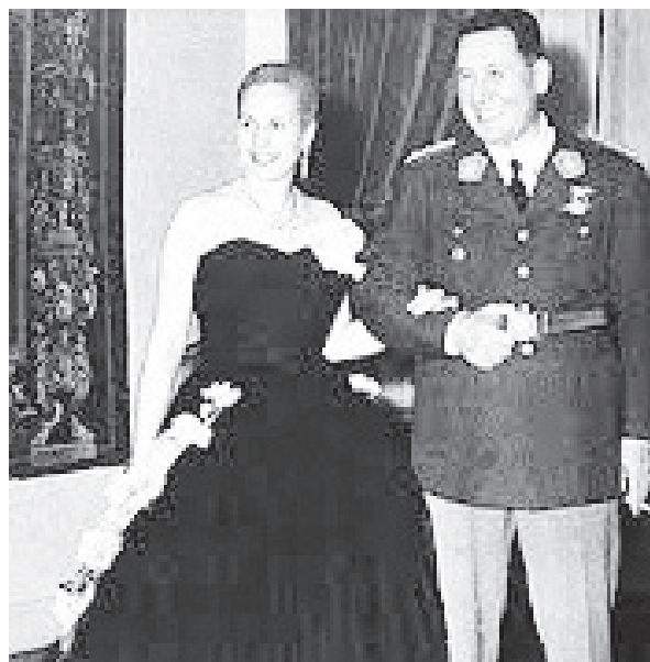
Peron and Evita, the coming of the Nazis, and the capture of Adolph Eichmann. TUESDAY, MAY 25 | 8 PM