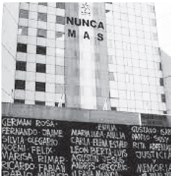
Two terrorist attacks in Buenos Aires and the death of Alberto Nisman. TUESDAY, JUNE 1 | 8 PM

We will first explore the historical, political, cultural and economic background that was the fertile ground to Argentina's neutrality in World War II. We will then look at the rise of Perón to power in the 1930s and 1940s that brought him to the presidency in 1946. How was his relationship with the Germans in general, and with the Nazi war criminals that came to Argentina in particular? How was his relationship with the Argentine Jewish community and the State of Israel? We will also cover the incredible capture of Adolph Eichmann at the hands of the Mossad, and the whereabouts of his family after his execution in Israel.