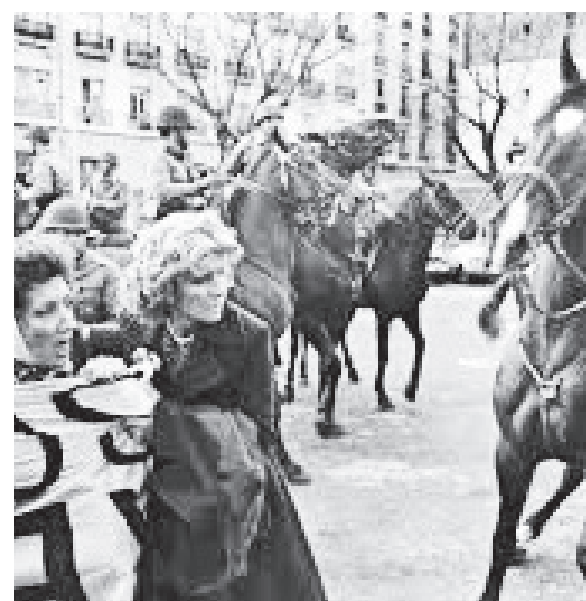
The last Dictatorship, the Disappeared and the Mothers of Plaza de Mayo. TUESDAY, JUNE 8 | 8 PM

In this third presentation, we will explore the political history of Argentina that led to the darkest chapter of the country's 20th century: the military dictatorship of 1976-1983. According to Human Rights organizations, around 30,000 people were kidnapped, tortured, killed and made to disappear. Courageous mothers of these young people began to gather in Plaza de Mayo (Buenos Aires' central square) and make their voices heard, and they became icons of the resistance of women around the world against authoritarian and totalitarian regimes. We will highlight the work of American rabbi and human rights activist, Marshall T. Meyer, and the story of internationally-known Argentine journalist, Jacobo Timerman, who was tortured by the military and wrote a scathing testimony against them: "Prisoner Without a Name. Cell Without a Number."