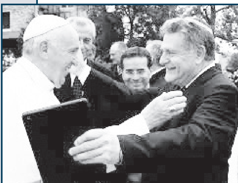
Pope Francis and Rabbis Skorka: a Catholic-Jewish friendship rooted in Argentina, with fruits around the world. WITH SPECIAL GUEST RABBI ABRAHAM SKORKA TUESDAY, JUNE 15 | 8 PM

Rabbi Skorka, who was a professor at St. Joseph's University and currently a Distinguished Professor at Gratz College in Philadelphia, PA, will share memories of that trip as well, and he will address the current state of Jewish-Christian relations.