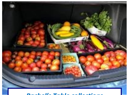
Rachel's Table collections

Rachel's Table is a hunger relief organization that uses volunteers to transport donated food to 30 food pantries, shelters, group homes, day programs, and soup kitchens in Worcester. The Children's Milk Fund program purchases milk for weekly deliveries to 20 of these agencies that help families. Rachel's Table also buys fruits and vegetables to be added to meals provided by Friendly House Neighborhood Center's summer meal program that feeds children at sites throughout the city when school is closed. Last year Rachel's Table provided over half a million pounds of food and milk. 20,000 children were helped by the Children's Milk Fund. With the increased price of food at present this help is crucial.