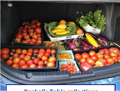
Rachel’s Table collections

Rachel's Table is a hunger relief organization that uses volunteers to transport donated food to 30 food pantries, shelters, group homes, day programs, and soup kitchens in Worcester. The Children's Milk Fund program purchases milk for weekly deliveries to 20 of these agencies that help families. Rachel's Table also buys fruits and vegetables to be add-ed to meals provided by Friendly House Neighborhood Center's summer meal program that feeds children at sites throughout the city when school is closed. Last year Rachel's Table provided over half a million pounds of food and milk. 20,000 children were helped by the Children's Milk Fund. With the increased price of food at present this help is crucial.