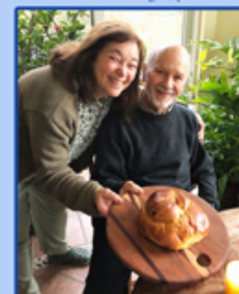
PJ family enjoying Shabbat gift