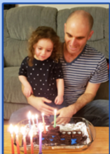
PJ family enjoying Hanukkah gift of an edible brownie menorah

December - Humanitarian Aid to Israel grants made to 4 organizations in Southern Israel