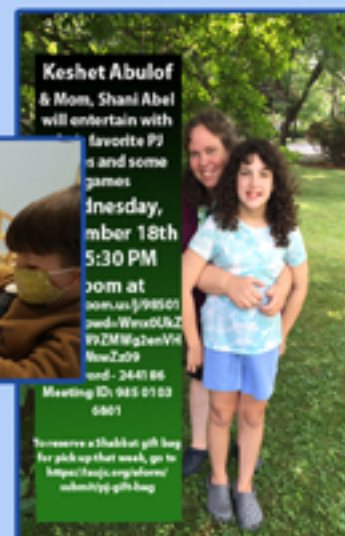
PJ Library Zoom presenters

RECEIPTS & DISTRIBUTED INVESTMENT RETURNS Total: $155,325