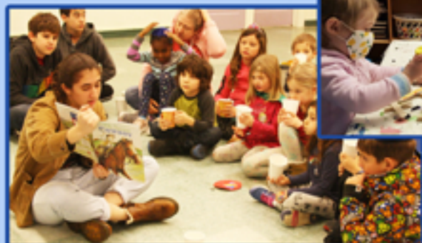
Jewish Stories from Around the World: a TvO and TBE program