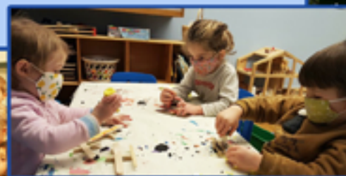
B'Yachad Ithaca Jewish Preschool