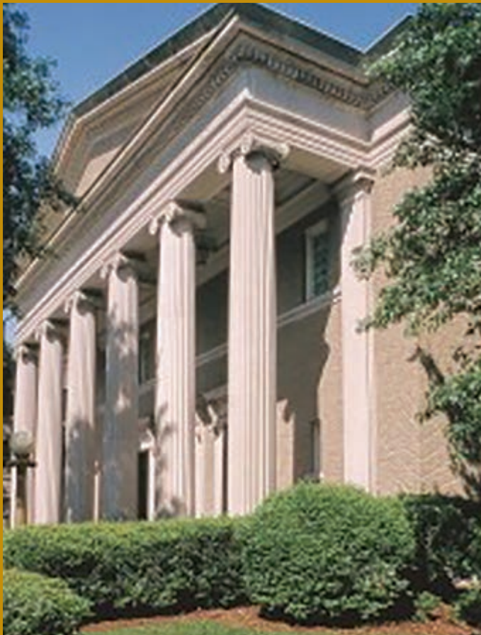
OHEF SHOLOM, NORFOLK VA

Tidewater Jewish Foundation (TJF) continues its role in shaping the landscape of Jewish life through development assistance and strategic investment of endowment funds. TJF's commitment to its agencies and affiliates enables the growth and perpetuation of each entity, which enriches the Jewish community's cultural, spiritual, and educational fabric.