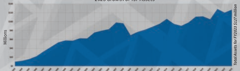
2023 Growth of TJF Assets