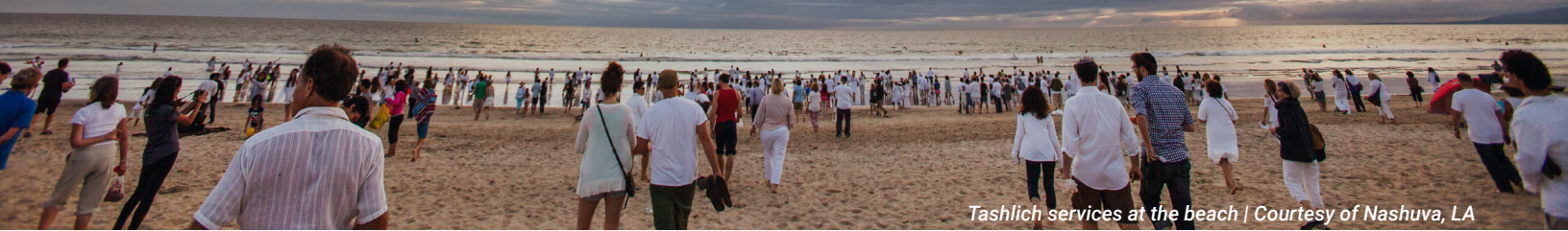
Tashlich services at the beach

The TJF team works with donors, their families, and often their professional advisors to develop meaningful, tax-wise philanthropic plans so they can maximize their gift's impact.