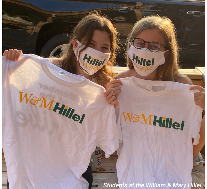
Students at the William & Mary Hillel

The Foundation's grant making program plays a crucial role in the community by providing seed money for new programs and services. This year, TJF awarded 65 community impact grants, valued at $366,000.