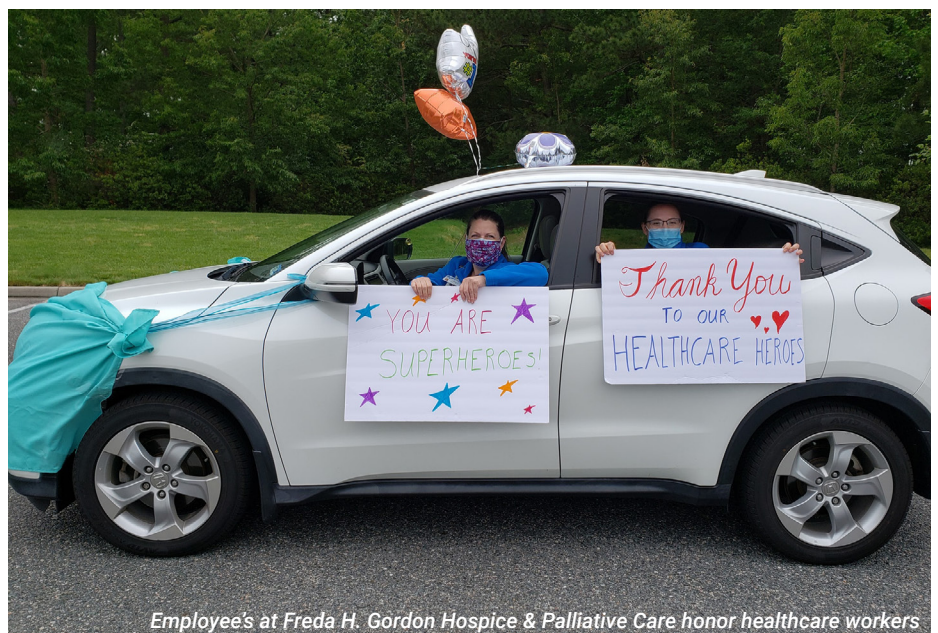
Employees at Freda H. Gordon Hospice & Palliative Care honor healthcare workers

Urgent needs such as emergency funds, food, and protective equipment still need to be met in our community. Help us meet those needs by making a donation to the COVID-19 Emergency Relief Fund of the Tidewater Jewish Community with the enclosed envelope on this page.