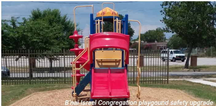
B'nai Israel Congregation playground safety upgrade