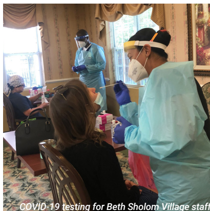
COVID-19 testing for Beth Shalom Village staff

Given to the COVID-19 emergency relief fund, in partnership with UJFT