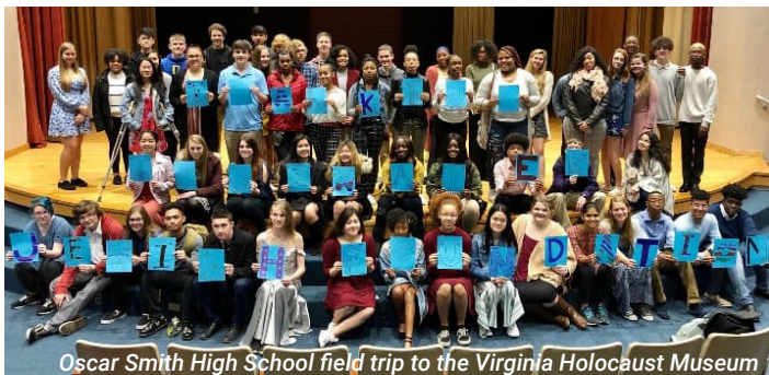
Oscar Smith High School field trip to the Virginia Holocaust Museum