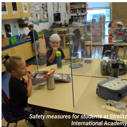
Safety measures for students at Strelitz International Academy