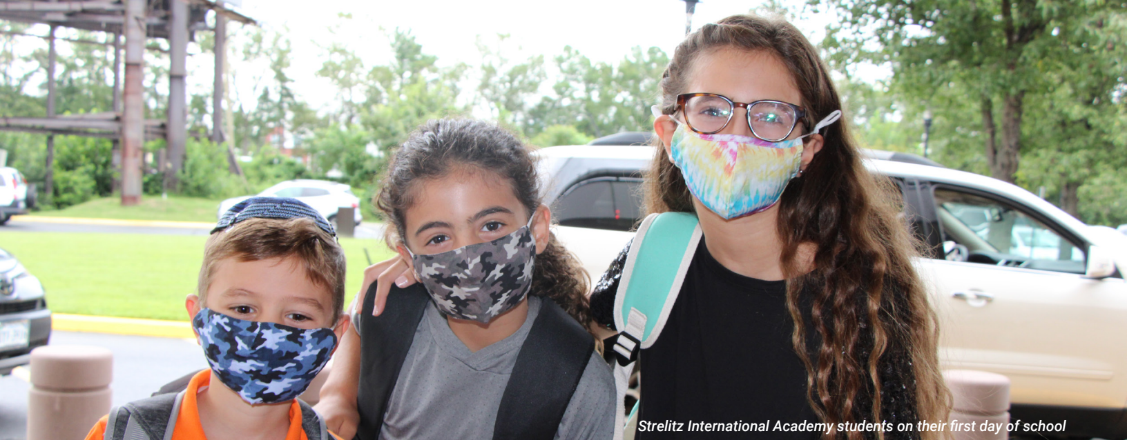
Strelitz International Academy students on their first day of school