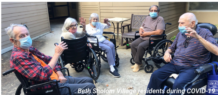
Beth Shalom Village residents during COVID-19