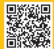
Scan Stein QR Code