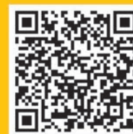
Scan Simon QR Code