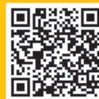
Scan Feldman QR Code

The Tidewater Jewish Foundation is proud to serve as the administrator of the Stein Family College Scholarship and the Feldman Family Medical & Health Professions Scholarship, and the Simon Family Passport to Israel grant. Scan the QR codes to learn more