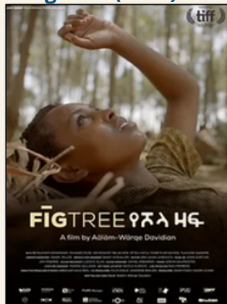
Fig Tree (2018)