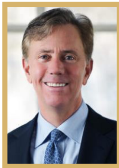
Ned Lamont (D)