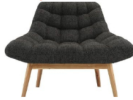
Lily Plush Linen Accen... $199.99 - Sofamania