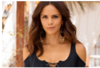
You Should Never Shop on Amazon Again After Seeing This Site