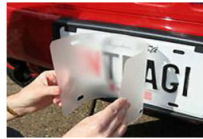
Highland Park, NJ's NEW RULE