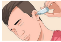
This Discovery Reveals Simple Tip to Improve Hearing (Try It Tonight)