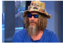
7 Time Lottery Winner Says "You're All Playing the Lottery Wrong!"