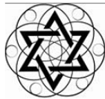
Congregation Beth Mordecai