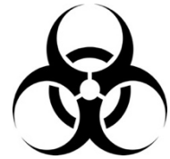
Certain Hazardous Material Incidents