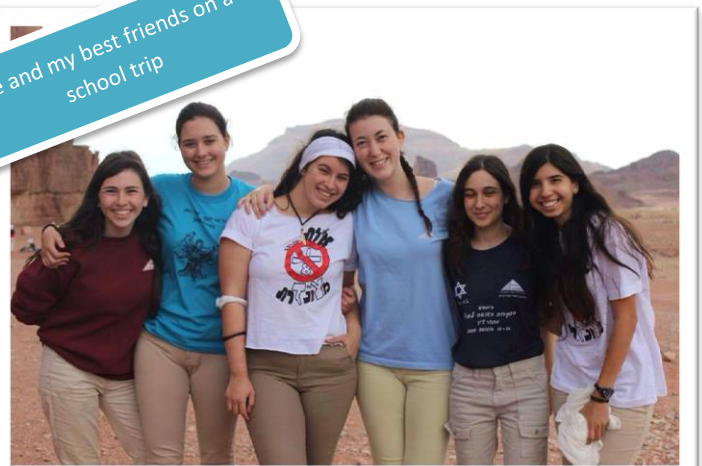
Me and my best friends on a school trip

I like hiking, baking and watching movies.