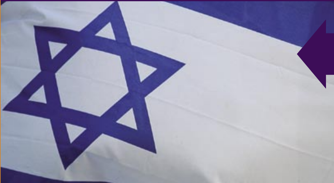
In its second year, JFGA's Israel Outcome produced impressive results

In its second year, JFGA's Israel Outcome produced impressive results, creating self-sufficiency through education and employment for Ethiopian-Israeli children, youth, and their parents.