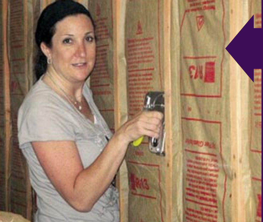
In May, JFGA sent 38 women on a social action mission to New Orleans