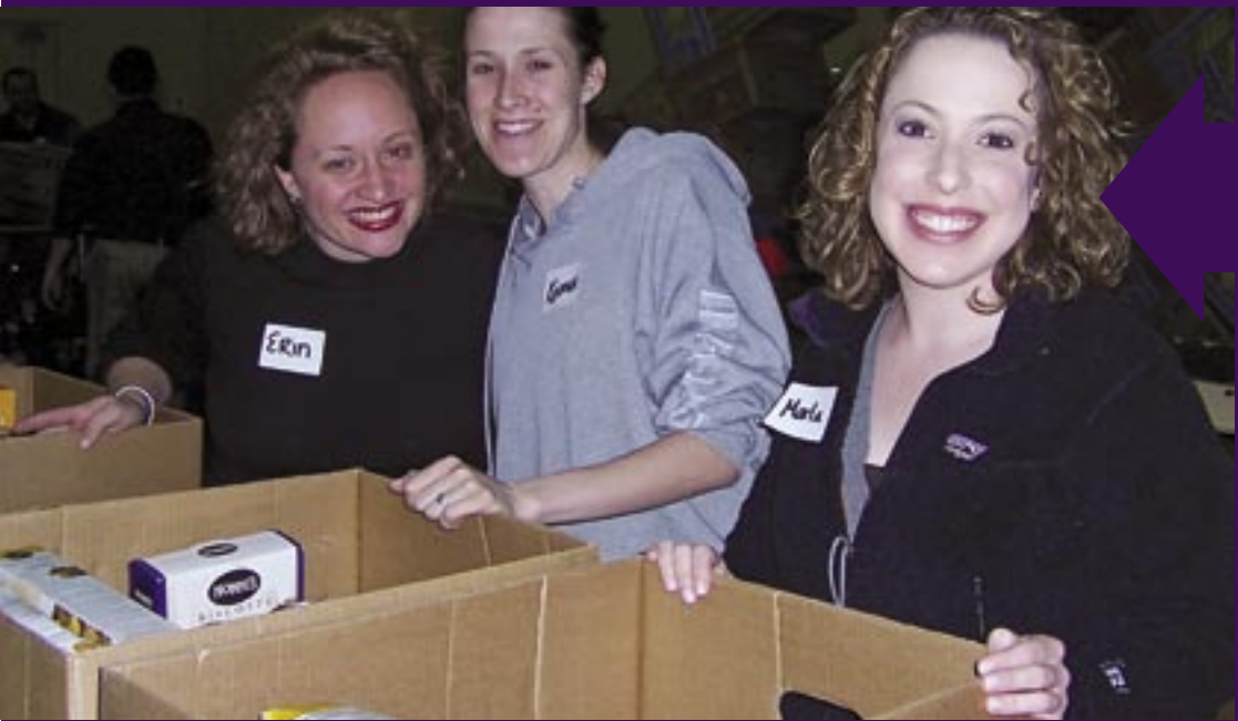
YLC lent a hand at the Atlanta Community Food Bank