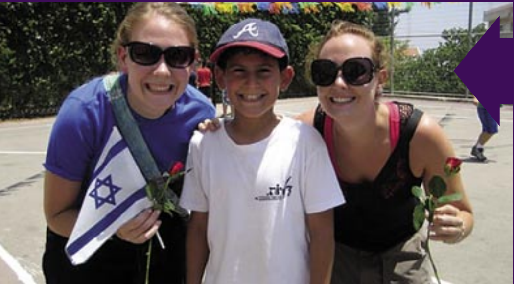
Our community is home to more than 3,000 Birthright Taglit Israel alumni.