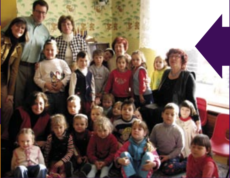
JFGA helped 1,500 children in Minsk, Belarus strengthen their Jewish Identity