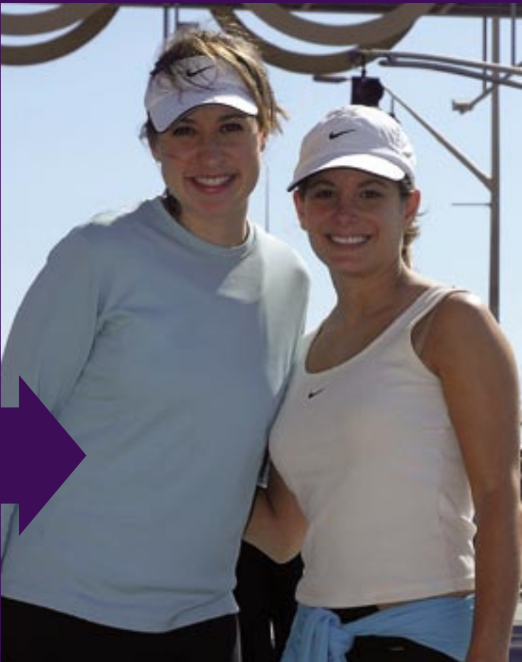
Federation raised $75,000 during this year’s Hunger Walk