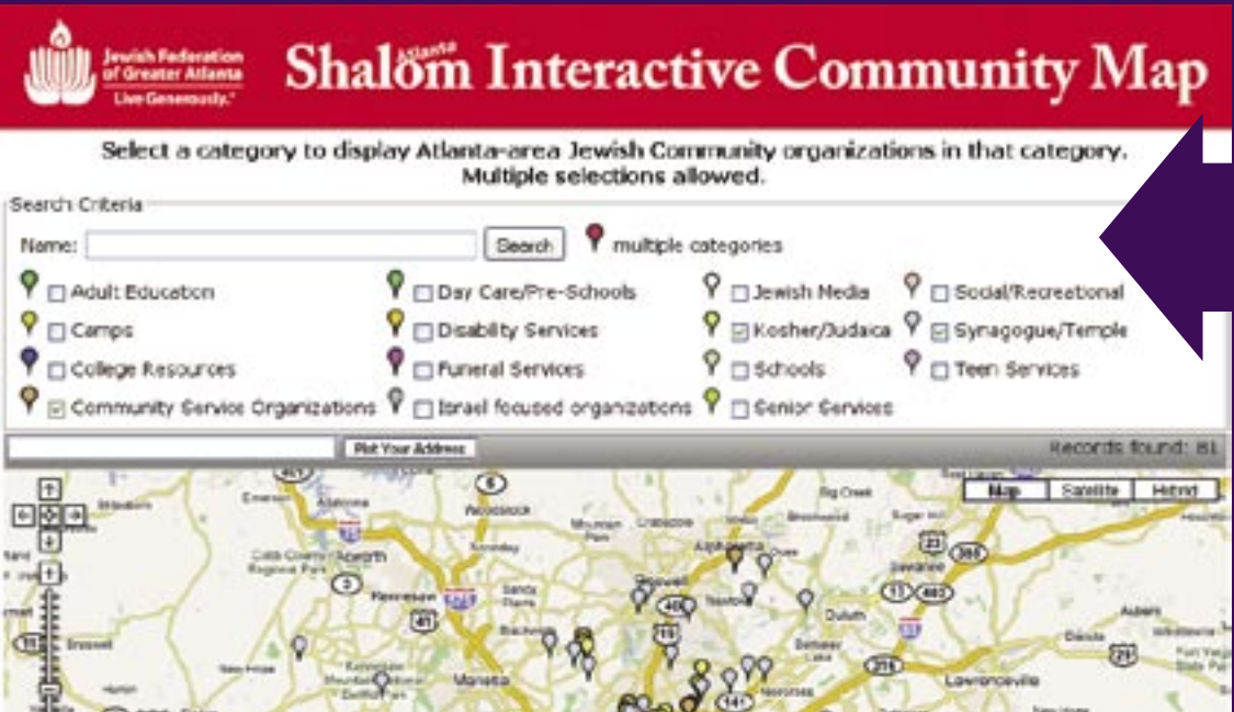
JFGA’s 20/20 Vision is a blueprint for our community’s future