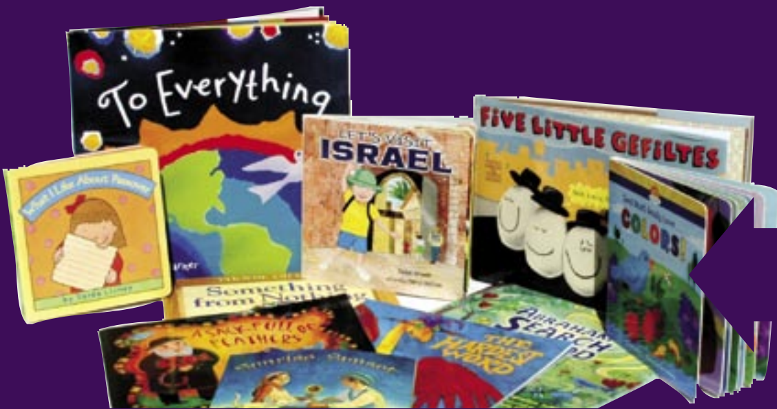
In its first year, Atlanta became the largest PJ Library community in the country