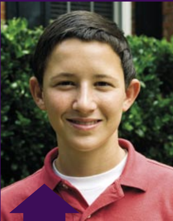
Federation promoted Jewish identity among local teens