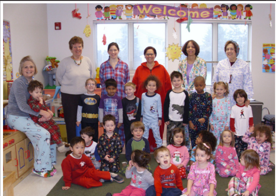
The Lakin Early Education Center celebrates the letter P week by having a Pajama Day!!

Weather related closings & delays will be posted on www.readingjewishcommunity.org (click on Reading Jewish Cultural Center Preschool) or www.wfmz.com . Please check one of these sites BEFORE bringing your child to school.