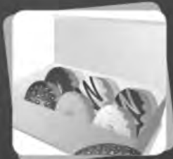
Donuts and latkes