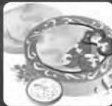
Latkes and applesauce