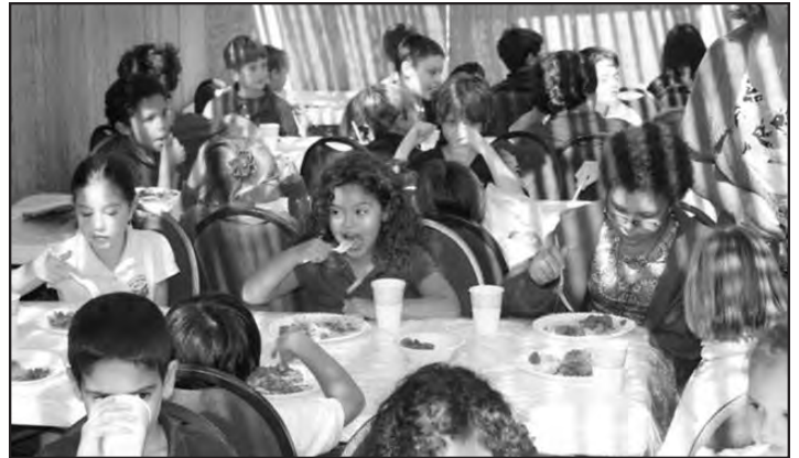
Lunch under the Sukkah!