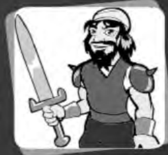
Take your picture with Judah Maccabee