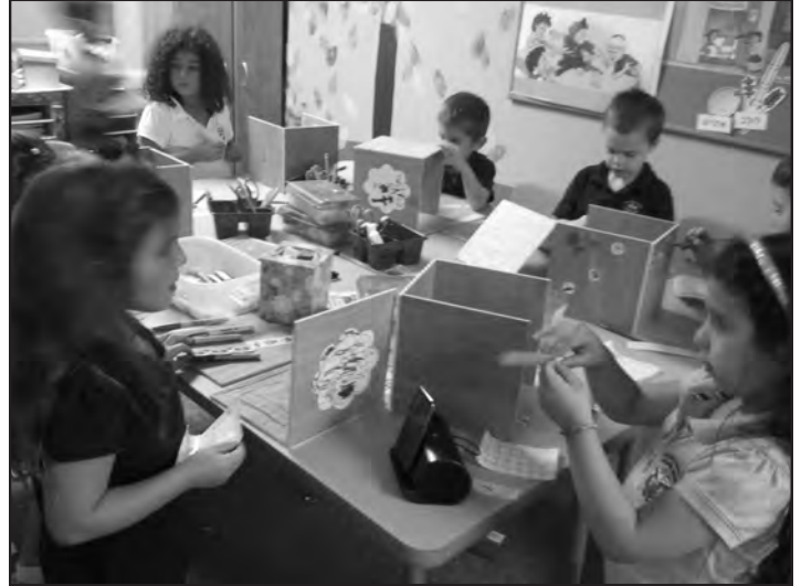
Students begin decorating the walls of their Sukkah