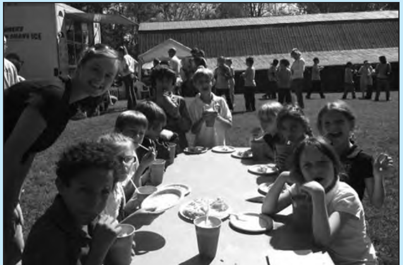
Field trip to the Appalachian Museum

Grade 2-5 students were thrilled to visit the Museum of Appalachia on Student Heritage Day. They toured old cabins and a school and saw lots of artifacts such as quilts, furniture, and tools that date back to hundreds of years ago. Additionally, since this was a special presentation by the museum, there were lots of demonstrations. For example, the students saw mules working to grind sugar cane and how the farmer cooks it into sorghum. Also, they watched candle making, wood working, blacksmithing, and an old fashioned spelling bee at the school house. The students' favorite stop at the museum was the old fashioned games interactive exhibition. The kids played kick the can and hopscotch, participated in three-legged races, potato sack races, and stilt races, walked a tight rope, jumped rope, etc. Even though all the kids had fun, they all decided they would rather live in 2011, with all our cozy amenities, than to live on an Appalachian farm without modern day tools and luxuries.