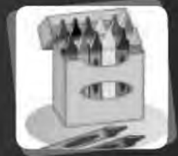
Chanukah Crafts for the kids!