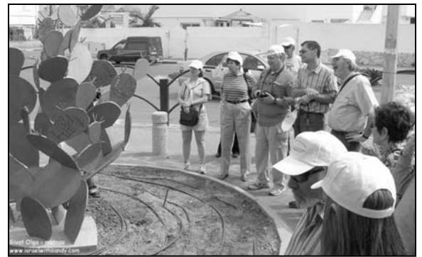
Camp Tikkun Olam students created sculptures in both countries. Mission participants view the CTO sculpture in Hadera.

ed 7,000. The original city dated to 500 B.C.E.