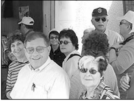
Participants stand in line outside a falafel shop.