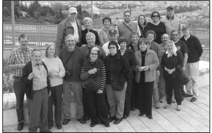
The KJA Mission Group gathers for a group photo on Mount Scopus.

Our next stop was Be'it She'an in the Jordan Valley, and an important archaeological site, said to contain 15 separate occupational layers, meaning that 15 different populations called this place their home over the centuries. The large amphitheater yielded impressive acoustics from the stage and seat-