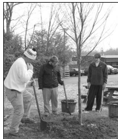
Oakes Nursery donated a beautiful tree in honor of TuB'Shvet, which was then planted by some hardy souls amid swirling snowflakes.