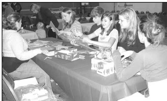
Teens package craft bags for delivery to East Tennessee Children's Hospital.