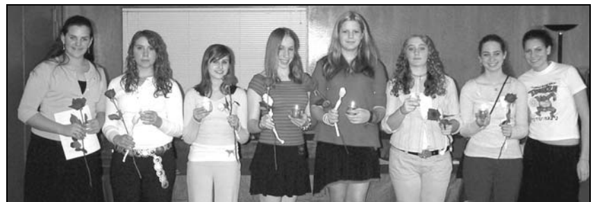
BBG new members