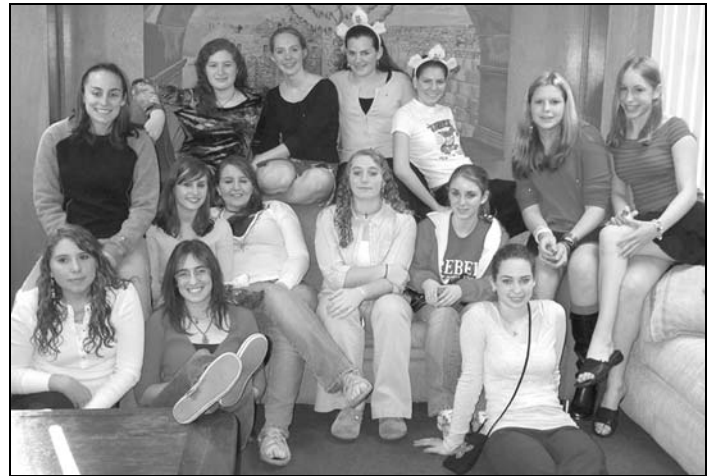
BBG Weinstein members