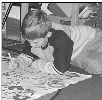
A child signs his name to a colorful Mitzvah Day banner that remains as a souvenir of a wonderful community event.