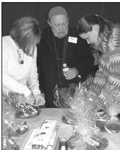
Cookies and special treats are attractively wrapped. These goodies will be delivered to firehalls throughout Knoxville later.