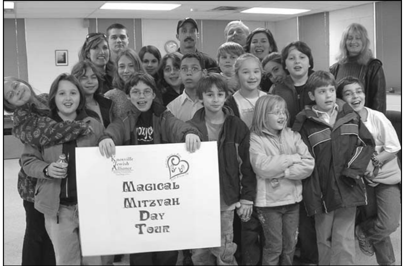
The Magical Mitzvah Day Tour delivered baked goods to a Fort Sanders fire station, then received a tour of the facility from the grateful staff.