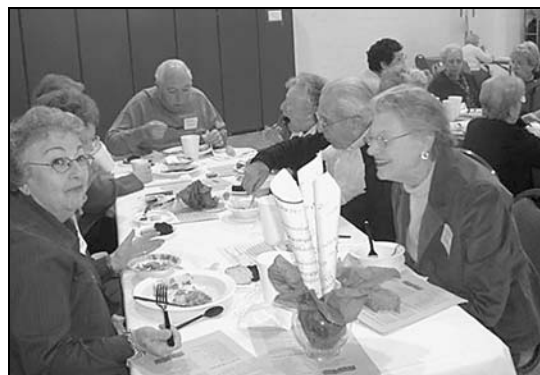
Friendshippers enjoy chatting over a delicious lunch prior to a musical program.