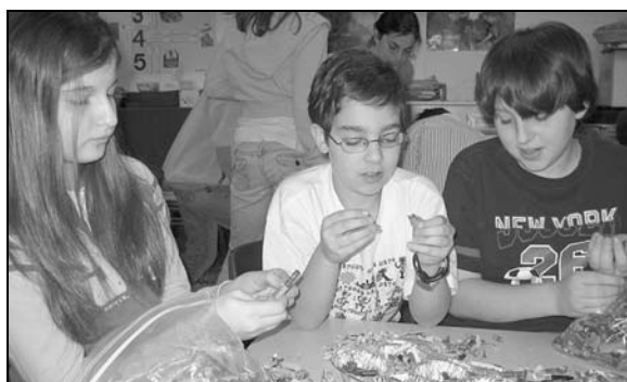
Children tear wrappings from crayons which are then melted to create new crayons during one Mitzvah Day project.