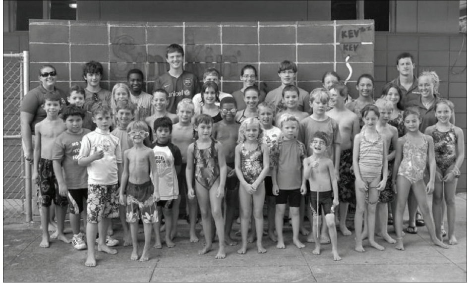
2012 AJCC Smokin' Salmon Team

In 2013, we hope to install a water heater at the showers to make an after swim shower more comfortable. We do have a quote for a small cabana for the north end of the pool. Sponsors are needed to make both of these improvements a reality.