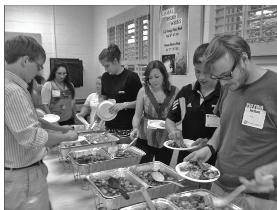
College students enjoy Shabbat dinners together. These on-campus gatherings are some of UTK Hillel's most popular activities.

Shabbat dinner, held in the Great Room of the International House several times a semester, continues to be our most popular ongoing program with an average participation of 65 students for each dinner. During the remaining weeks, we rely on community members to host