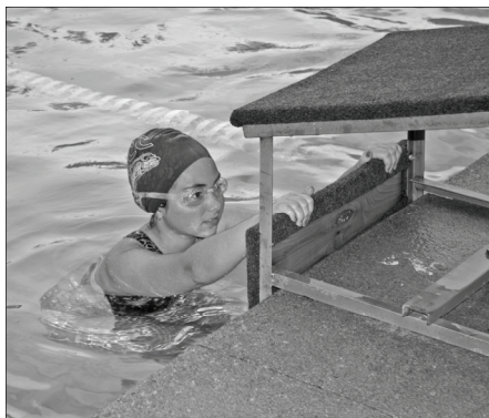
AJCC Preschool Promotion