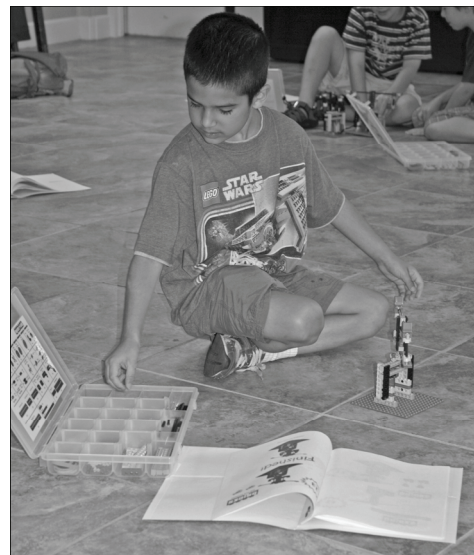
Bricks4Kids intrigued young campers.