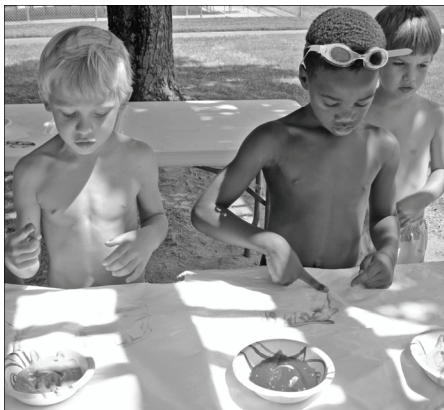
Food art was a delicious elective.

We would like to thank the Executive Committee, parents, and all our supporters for their cooperation. The work of many has enabled Milton Collins Day Camp to be a continued success. The camp is looking forward to the coming season and will work with all stakeholders in order to establish improvements to the registration procedures and other aspects of the programming.