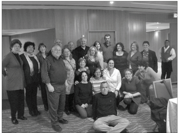
2012 Taste of Partnership travelers

The Windows of Identity art project, currently on display here in Knoxville, features both U.S. and Israeli artists who were invited to create an expression of their Jewish identity on canvas to be part of a regional display inaugurated in Israel during the Celebration. The collaborative art piece includes work from both U.S. and Israeli artists and was on display in the art exhibit section of the Hadera Mall last February 19-March 19. After its opening in Israel, the exhibit has been featured in Nashville, Chattanooga and will remain here in Knoxville for several weeks before traveling to Jacksonville, Florida. A second phase of the project is currently in process and interested artists are encouraged to participate.