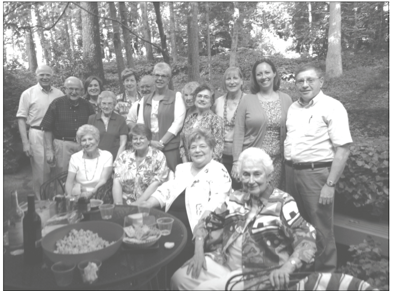
Archives Committee and guests at Bernstein home party, June 2012