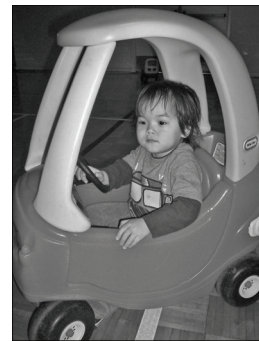
The AJCC Gym provides preschool students with room to play on cold or rainy days.

We are working to build enrollment for the Preschool and Camp program. There are several ways that we will accomplish this. The first method is increasing our presence on social media sites such as Facebook and Pinterest. Two experienced marketing professionals suggested this route of marketing as our lowest cost most effective method for reaching parents of preschool aged children. The Preschool administrative staff has been working diligently to create meaningful posts for current families while engaging potential families. We are also updating our website to mirror other marketing materials that we give to parents during tours and open house.