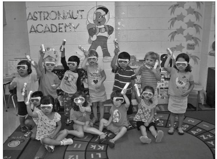
AJCC Preschoolers "graduate" from Astronaut Academy.