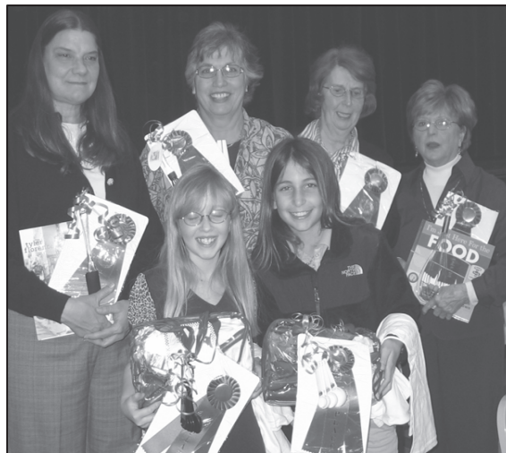
This could be you in 2009!