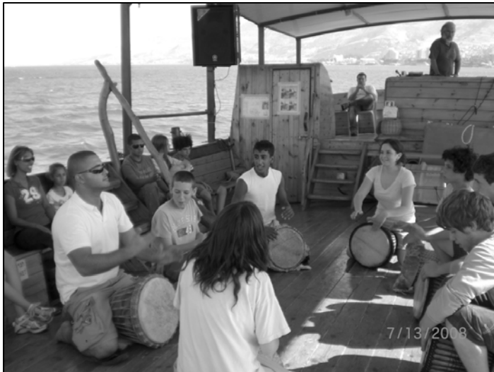
Tikkun Olam campers enjoy a drumming session on a boat ride on the Kinneret in Tiberias, Israel.