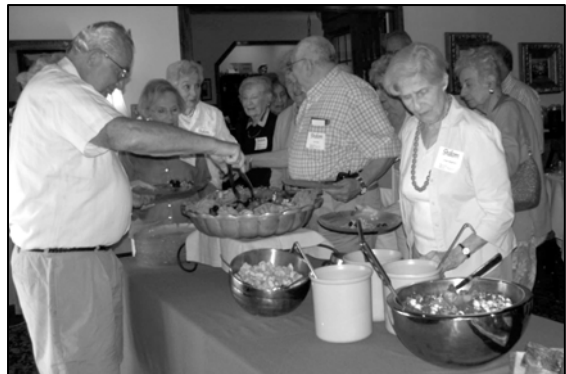
Friendshippers enjoy good food and good times at the July program.