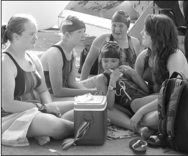
Swim Team members relax before the AJCC -Cherokee Country Club swim meet.