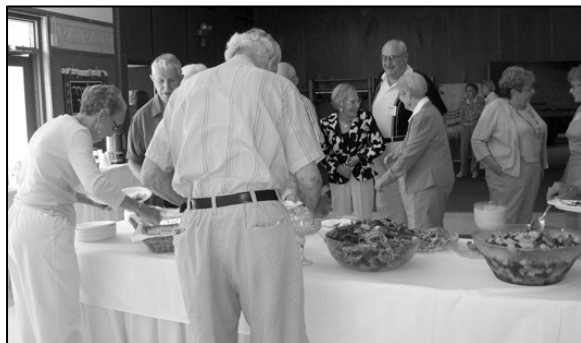
Seniors enjoying Friendshippers luncheon