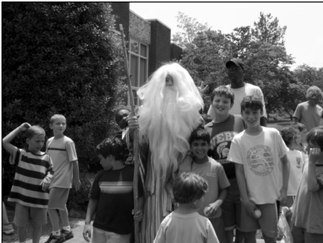
Moses visited camp on Shavuot.