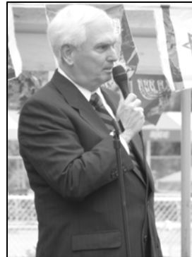
Congressman John Duncan, Jr. welcomes visitors at IsraelFest