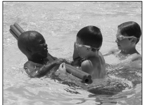
MCDC campers enjoy some pool time.