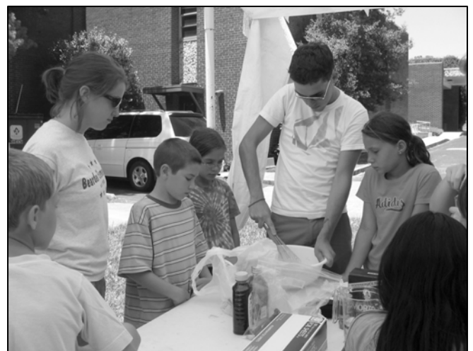
Campers make Challah during a cooking elective at Milton Collins Day Camp.