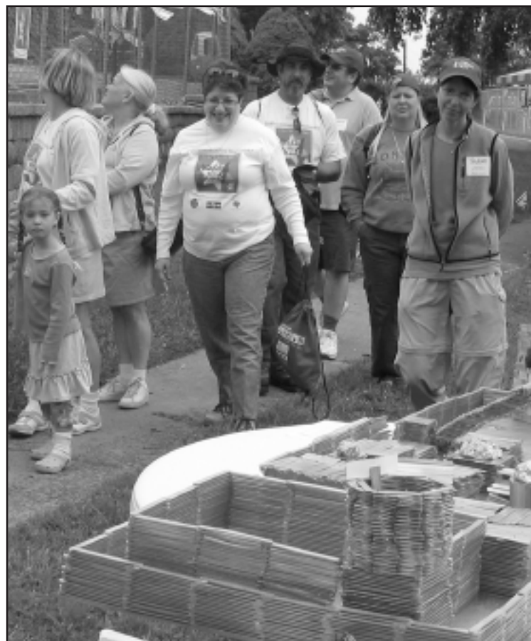
Walkers begin the "Walk the Land" walk before IsraelFest. On the right is a replica of the city of Jerusalem created by the Knoxville Jewish Day School.