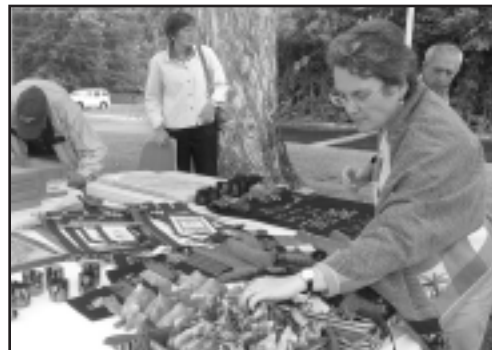
Vendors featured Jewish and Israeli goods.