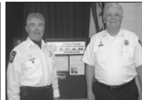
Two officers were part of a program on identity theft.