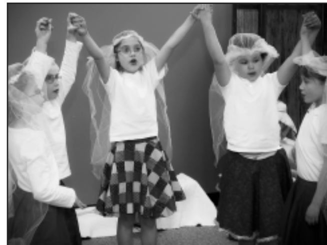
Children enact the Passover story at the Knoxville Jewish Day School.

To become a special friend for new students in the 2008/09 school year, or for more information about any of these programs, please contact the KJDS office at 560-9922.