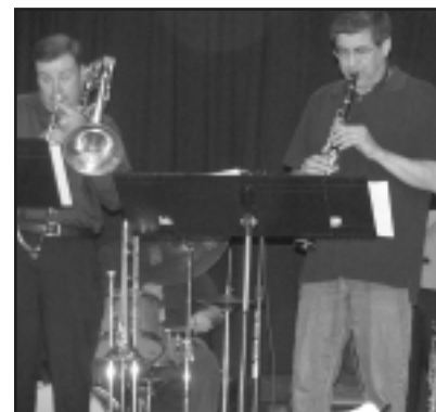
Dor L' Dor's klezmer band entertains the crowd during IsraelFest.