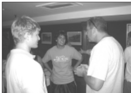
Coach Bruce Pearl chats with students at the opening Hillel program.