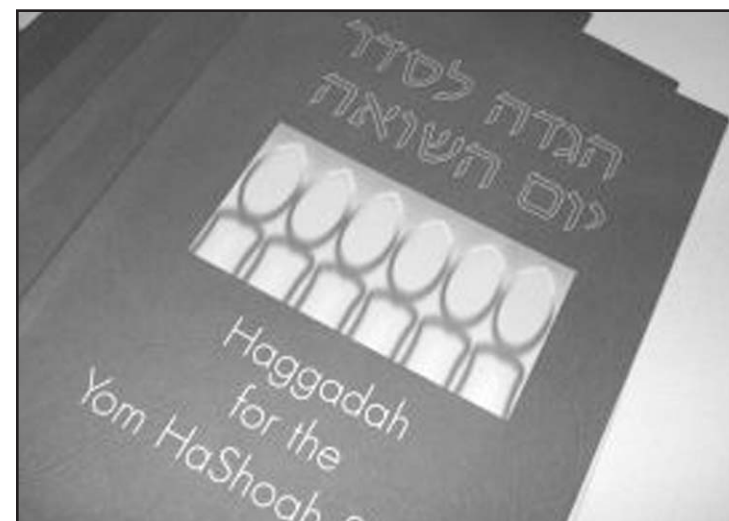
Participants read from a haggadah at the Yom HaShoah event.