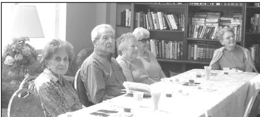
Jewish Family Services hosts a seder during Passover.