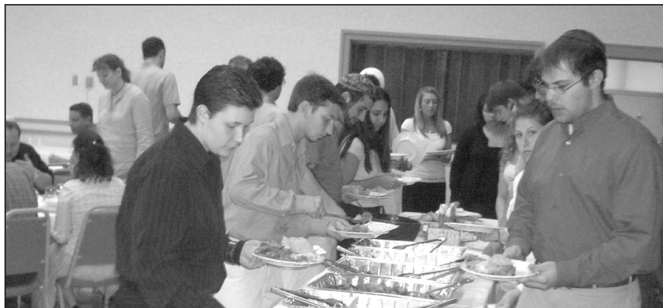
Students enjoy a Pesach meal at the UT Hillel seder.