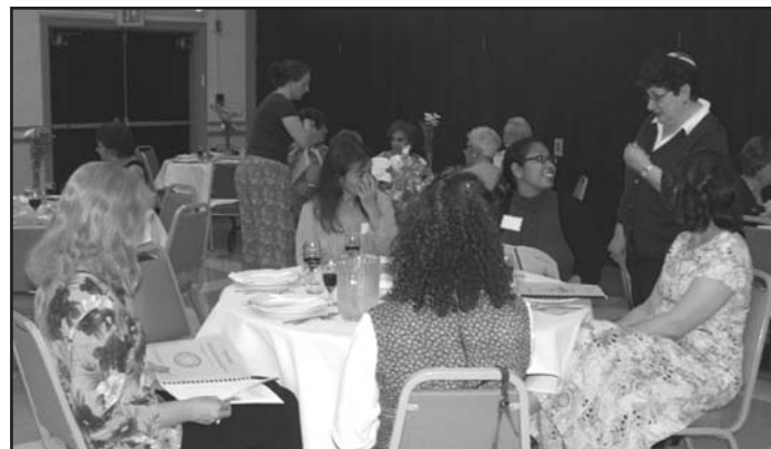
Participants at Temple Beth El's Women's Seder