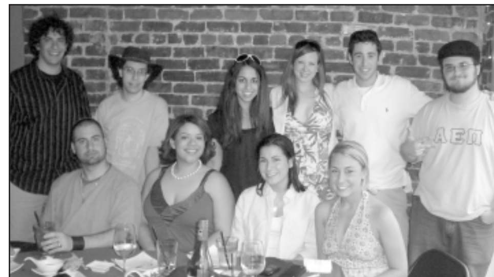
The following students have been elected for leadership positions for the upcoming school year: