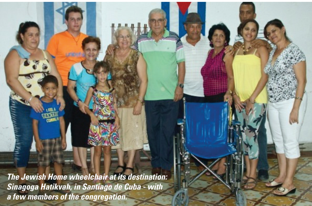
The Jewish Home wheelchair at its destination: Sinagoga Hatikvah, in Santiago de Cuba - with a few members of the congregation.

First of all, the Jewish Home wheelchair made it to Santiago, where there was great delight upon its arrival. Maintenance at the Home got the wheelchair all spiffed up with new wheels and what appeared to be "detailing," so it looked brand-new and quite handsome. The gifts the Jewish Home sent are badly needed - blood pressure cuffs, insulin syringes, blood glucose testing meters and strips - the government provides meters but people who must test their blood have to find and purchase the strips themselves - and the strips are too costly for most. Canes - there were three to distribute - were on sale at a Havana "supermercado" priced at $35 cuc (Cuban Universal Currency) - way out of range for most Cubans. The recipients of the Home's generosity are thrilled.