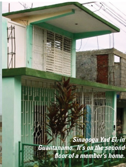
Sinagoga Yad El, in Guantamo. It's on the second floor of a member's home.