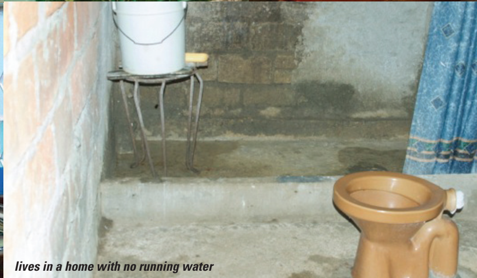
lives in a home with no running water