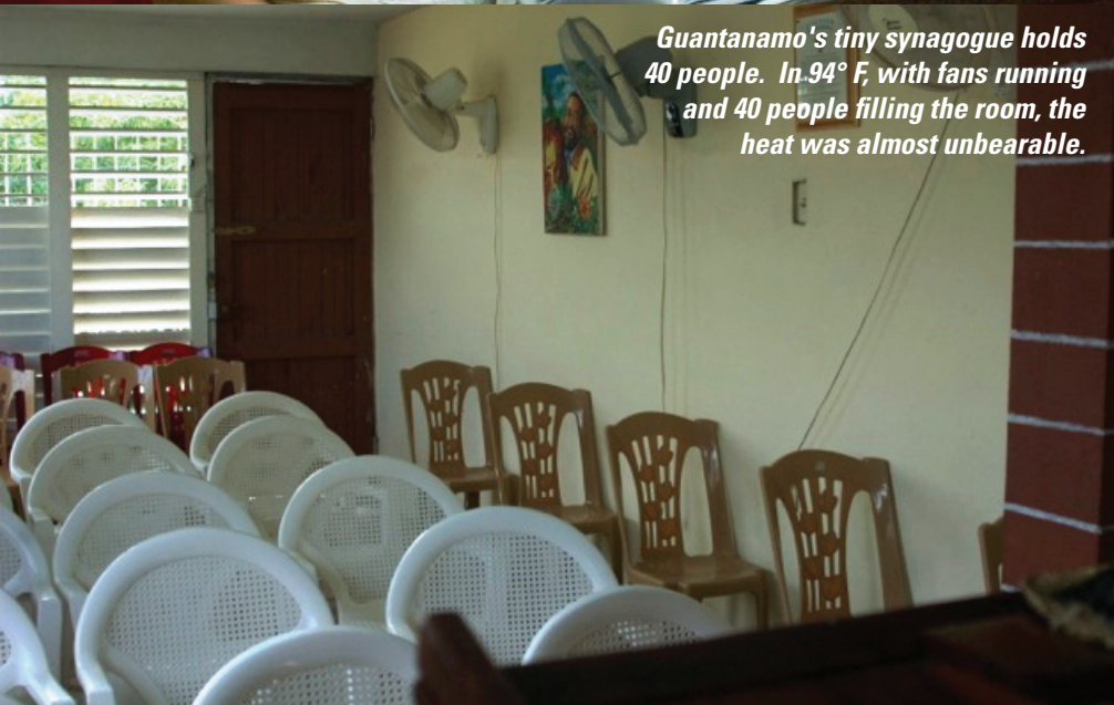
Guantamo's tiny synagogue holds 40 people. In 94° F, with fans running and 40 people filling the room, the heat was almost unbearable.