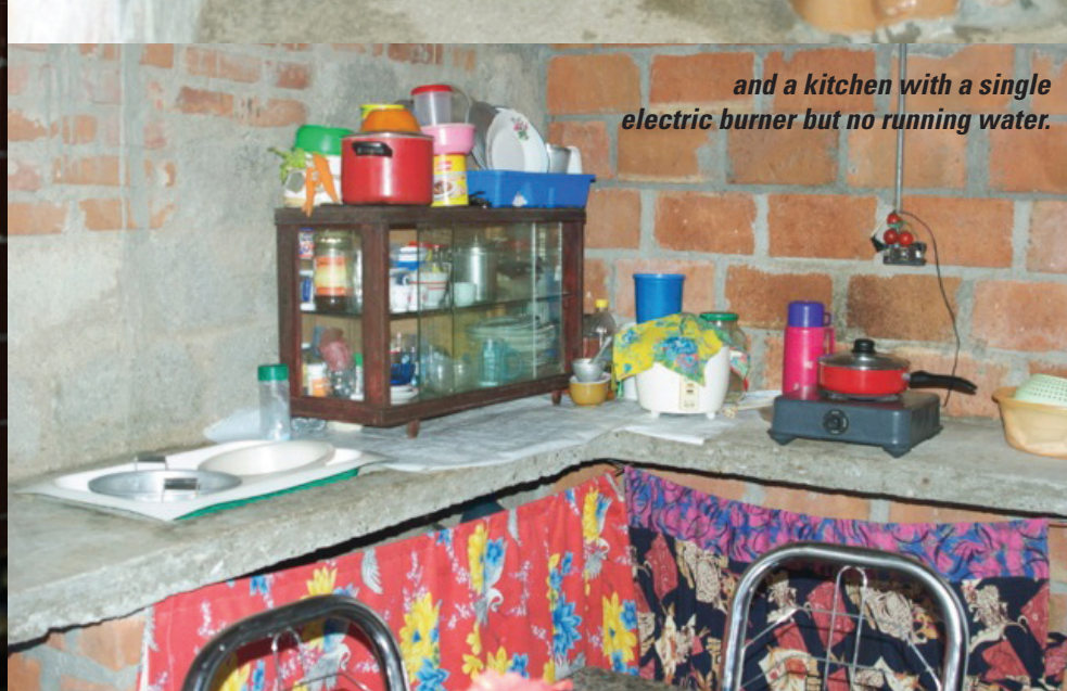
and a kitchen with a single electric burner but no running water.