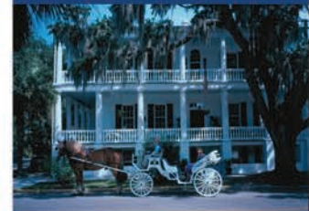
You'll feel like you've traveled back in time