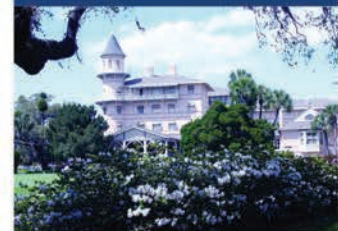
Jekyll Island - Georgia's elite coastal barrier island