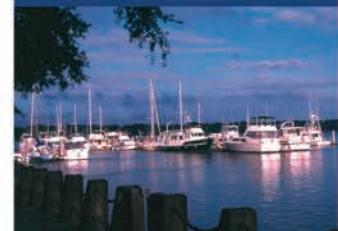
Beaufort, SC - "Queen of the Carolina Sea Islands"