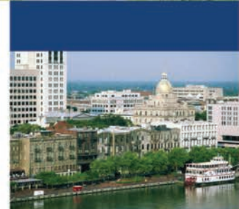
Savannah - the "Belle of Georgia"

$75 Due Upon Signing. *Price per person, based on double occupancy. Add $150 for single occupancy. Final Payment Due: 2/7/2013