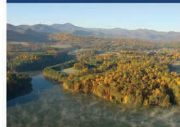
View the Blue Ridge Mountains.