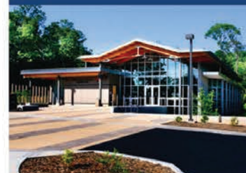
New Blue Ridge Parkway Visitor Center.