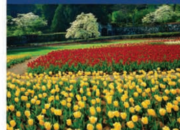
One of the Biltmore's many gardens.

Departure: Harrisburg Jewish Community Center, 3301 N Front St, Harrisburg, PA @ 8 am