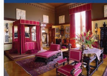
Grand Victorian architecture.