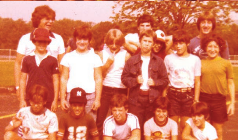
JCC Summer Camp, circa 1974