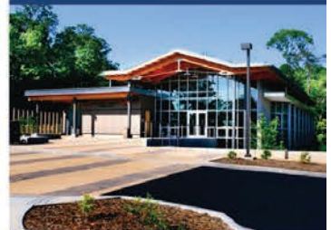
New Blue Ridge Parkway Visitor Center.