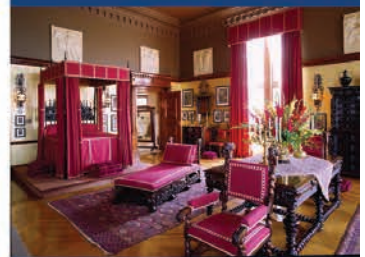
Grand Victorian architecture.