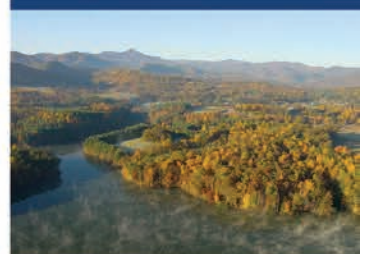
View the Blue Ridge Mountains.

Day 4: Today after enjoying a Continental Breakfast, you depart for home... A perfect time to chat with your friends about all the fun things you've done, the spectacular sights you've seen and where your next group trip will take you!