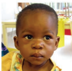
Glads from Tanzania

Due to the overwhelming support of the Harrisburg Jewish Community, we are able to sponsor 2 children through SACH!